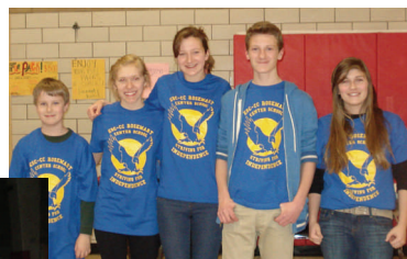
Grown up offspring came to help, as did the grownups!